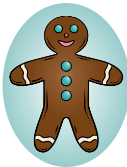
a gingerbread man