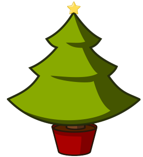
a Christmas tree